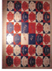
Hallway Bulletin Board