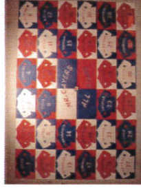
Hallway Bulletin Board