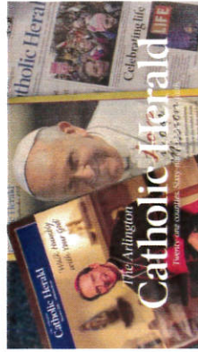
Arlington Catholic Herald