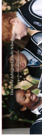
Diocese of Arlington Catholic Schools